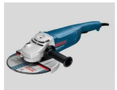
36 | Angle grinder (GWS22-230JH, disc Ø 230 mm, weight 5.2 kg, 2200 W)