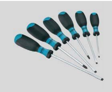
17 | Screwdriver set 6-part (standard 3.5/4.5/5.5/6.5 slotted screws and PH1/PH2 crosstip)