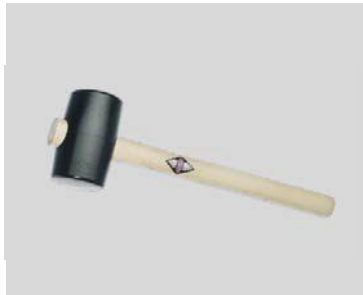
14 | Rubber hammer (weight 785 g, Ø 75 mm)