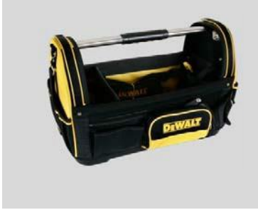
61 | Toolbox Nylon (8 exterior cases, tear- and waterproof padded aluminium carrying handle)