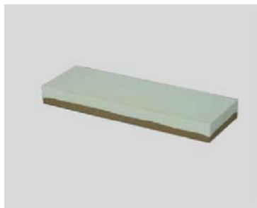
10 | Grindstone "Arkansas Brocken" (100 x 50 x 20 mm, fine and coarse combination)