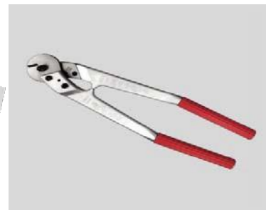
12 | Cable cutter (for steel cables Ø 16 mm, weight 2600 g, length 630 mm)