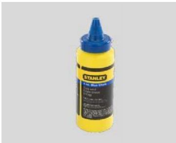
53 | Chalk dust refill box (115 g blue chalk powder refill)