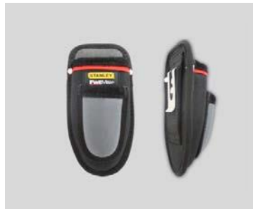
03 | Knife holster with blade pocket (Strong belt clip to hook onto trousers/belt or belt loop to allow use with tool belts)