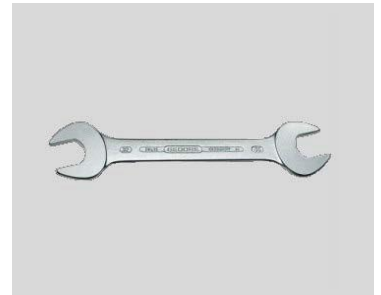
20 | Double open-end spanner 32x36 mm (DIN 3110, chromium-vanadium steel)