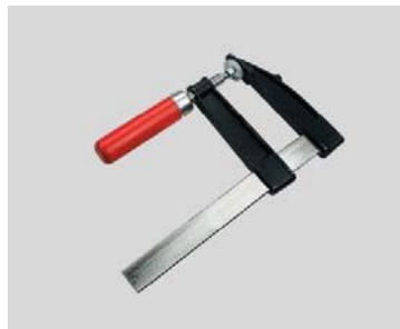
23 | Screw clamp (malleable (cast) iron, clamping width 300 mm, radius 140 mm)