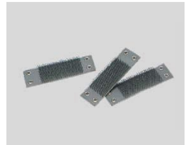
32 | Spare pad for handhelp rasp