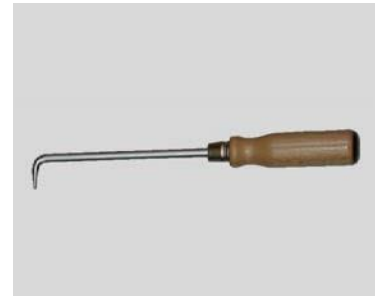
28 | Textil lever / stripping hook (for preparing fabric conveyor belt splices)