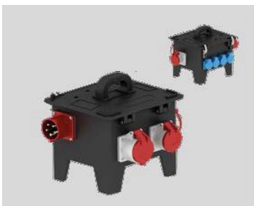
57 | Power distributor / router (1x CEE 5x32, 2x CEE 5x16, 4x Schuko plug)