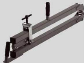
46 | Double-acting rollers (for belt width of 800 mm to 2,000 mm)