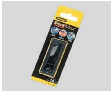
02 | Spare blades for cutter knife (10 pieces in a box)