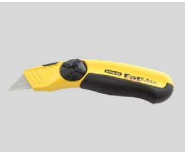
01 | Professional Stanley cutter knife (incl. magazine with 5 blades)