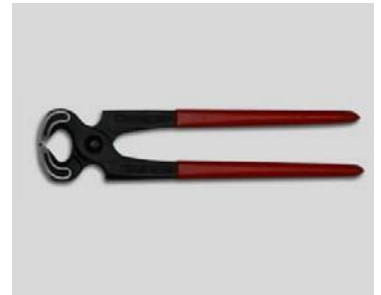
16 | Pincers (length 250 mm, pincers atramentized)