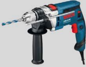
37 | Drilling machine (GSB-13RE, forward/ reverse rotation, spindle collar Ø 43 mm, weight 1.6 kg, drilling dia concrete/steel: Ø 13/10)