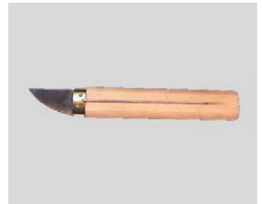
04 | Cobbler's knife (TINA knife) with retractable blade (blade screwed 3x, blade adjustable 5x)