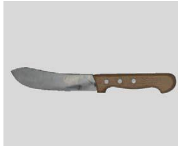
07 | Saddler's knife (rubber knife, blade length approx. 150 mm, 6")