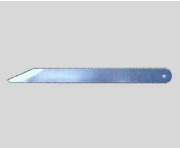
05 | Blade for cobbler's knife (TINA blade)