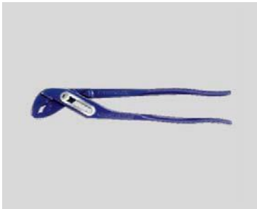
25 | Water pump pliers (chromium-vanadium steel, total length 240 mm, grip width 33 mm)