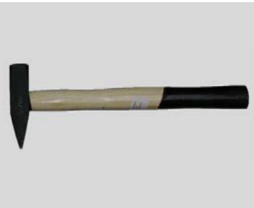
13 | Locksmith's hammer (weight 800 g with hickory handle)