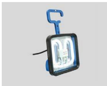
58 | Portable floodlight (1x Schuko plug on the backside, 1.8 m cable and Schuko plug)