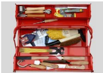
ToolSet 1 | Toolbox basically equipped for rubber works