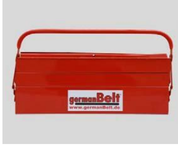
62 | Toolbox 5-part (steel sheet, colour red, 530 x 200 x 200 mm)