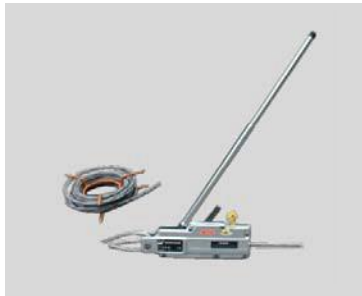
26 | Hand winch 0.8 t or 1.6 t (including winch, handle, 10 m rope and reeler)