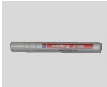
54 | Edding 750 paint marker (white ink colour)