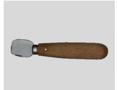
08 | Ply separating knife with two notches