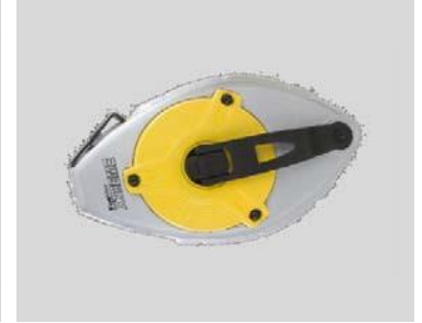
52 | Chalk line 30 m (including chalk dust container for 30 g)