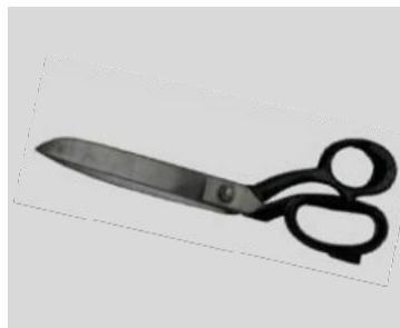
11 | Work scissor (available for right-hander, in 8/9 or 10")