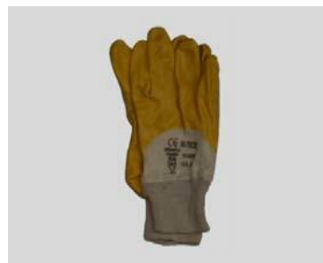
59 | Standard safety gloves (resistance levels according to EN 388 - 3.1.1.1, in various sizes)