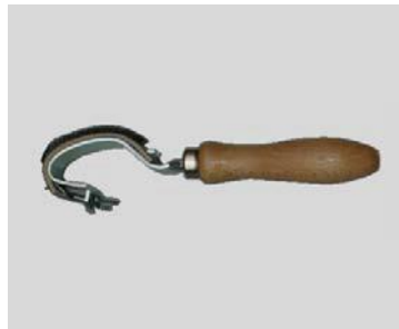
31 | Handhelp rasp with pad (manual roughening of rubber surfaces / ends of conveyor belts)