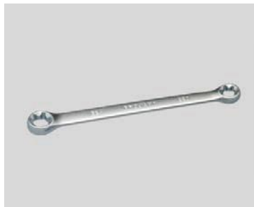
22 | Double-end ring spanner 32x36 mm (DIN 838, chromium-vanadium steel)