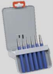
41 | Drift pin set 6-part (in metallic case, chromium- vanadium steel, DIN 6458, 1/2/3/4/5 + 10 mm)