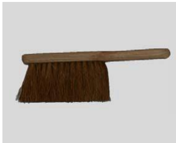
30 | Hand brush with wooden handle (length 280 mm, four-row)