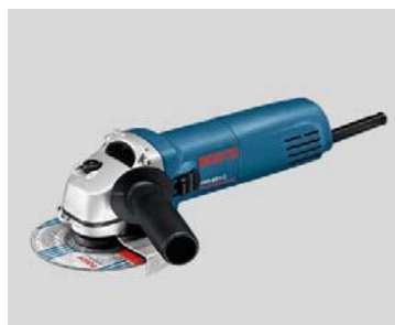
35 | Angle grinder (GWS850C, disc Ø 125 mm, weight 1.5 kg, 850 W, grinding spindle thread M14)