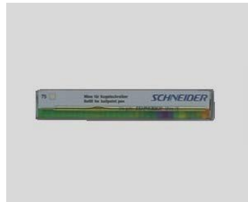
55 | Silver ball pen refills (colour silver, line width M)