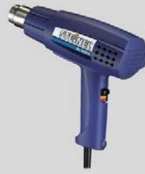
39 | Hot-air blower (HL1610S, 1600W, step 1/2: 300/500 °C, air volume: 240/450 l/min, weight 700 g)