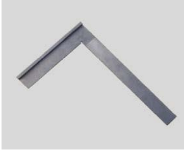
49 | Steel square with fance (1000 x 500 mm or 600 x 330 mm)