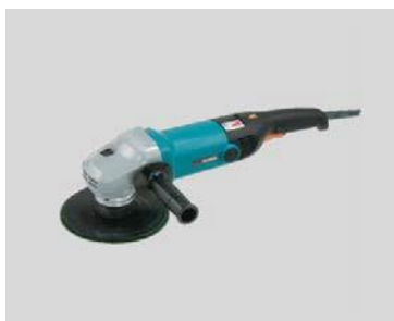
34 | Roughing machine (SA7000C, Ø 180 mm, weight 3.4 kg, 24 V/1600 W, grinding spindle thread M14)