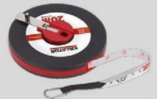
48 | Spring-tape measure tool 20 m