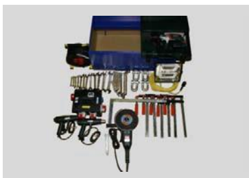
ToolSet 2 | Toolbox equipped for advanced vulcanizing works