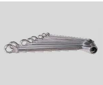
21 | Double-end ring spanner set 12-part (DIN 838, chromium-vanadium steel, 6x7 - 30x32 mm)