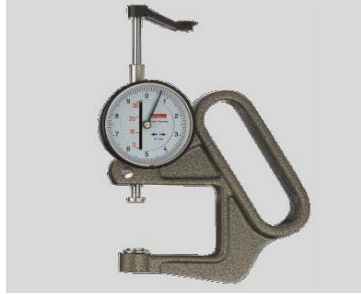
50 | Micrometer (measuring range 0-30 mm / measuring depth up to 50 mm)