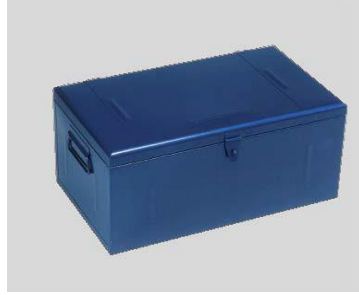
63 | Tool case (steel sheet, colour blue, 910 x 530 x 430 mm)