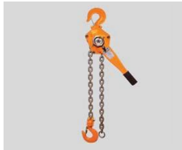
27 | Ratchet lever hoist with steel chain (loading capacity 750 kg (20 daN) or 1500 kg (35 daN))