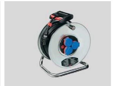
56 | Cable drum (3 Schuko sockets, cable length 40 m, drum out of galvanized sheet steel, cable rubber H07 3 x 1.5 mm 2 )