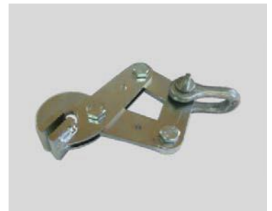
24 | Vice grip (maximum tensile force 8 kN or 10 kN available)