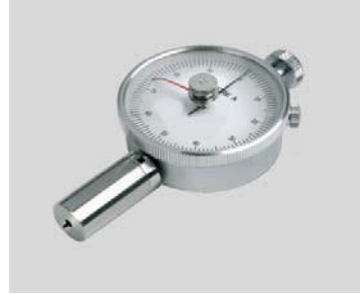
51 | Shore A hardness device (hardness determination for natural rubber, soft plastics, elastomer material, 0 - 100 display)