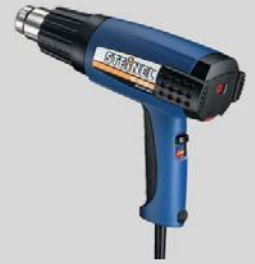
40 | Hot air blower (HL1910E, temperature 50 - 600 °C, air volume: 150/300/500 l/min, weight 850 g, 2000 W)