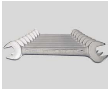
19 | Double open-end spanner set 12-part (DIN 3110, chromium-vanadium steel, 6x7 - 30x32 mm)