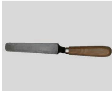
06 | Offset flexible knife (Total length 310 mm, blade length approx. 160 mm)