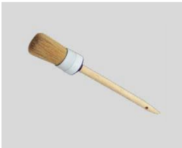
29 | Round brush (sizes 8/10/12 or 14)