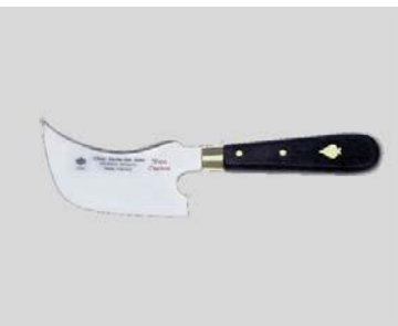
09 | Quarter moon knife (wooden handle, blade length 100 mm)