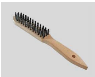
33 | Hand wire brush