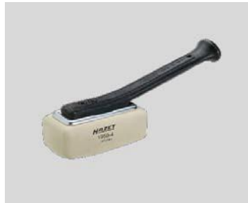
15 | Fixing hammer (weight 1300 g, 28.4 x 14.0 x 9.8 mm)