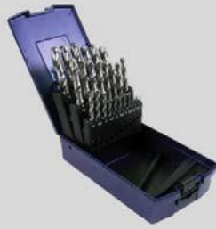
38 | Spiral drill set 25-part (in metallic case, Ø 1 - 13 mm, DIN 338)