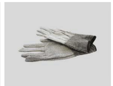
60 | Cut resistant gloves (resistance levels according to EN 388 - 4.5.4.0, in various sizes)