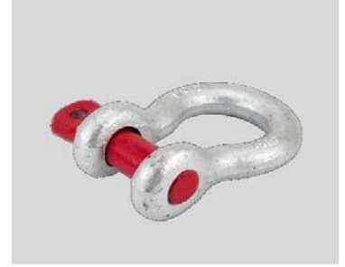
64 | Shackle (high-strength, loading capacity 3.25 / 4.75 / 6.50 t)